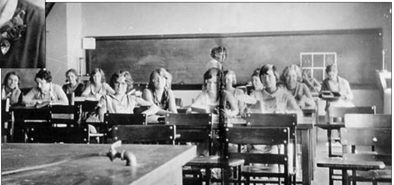
11 girls and 3 boys attended this B11 physics class in 1929.