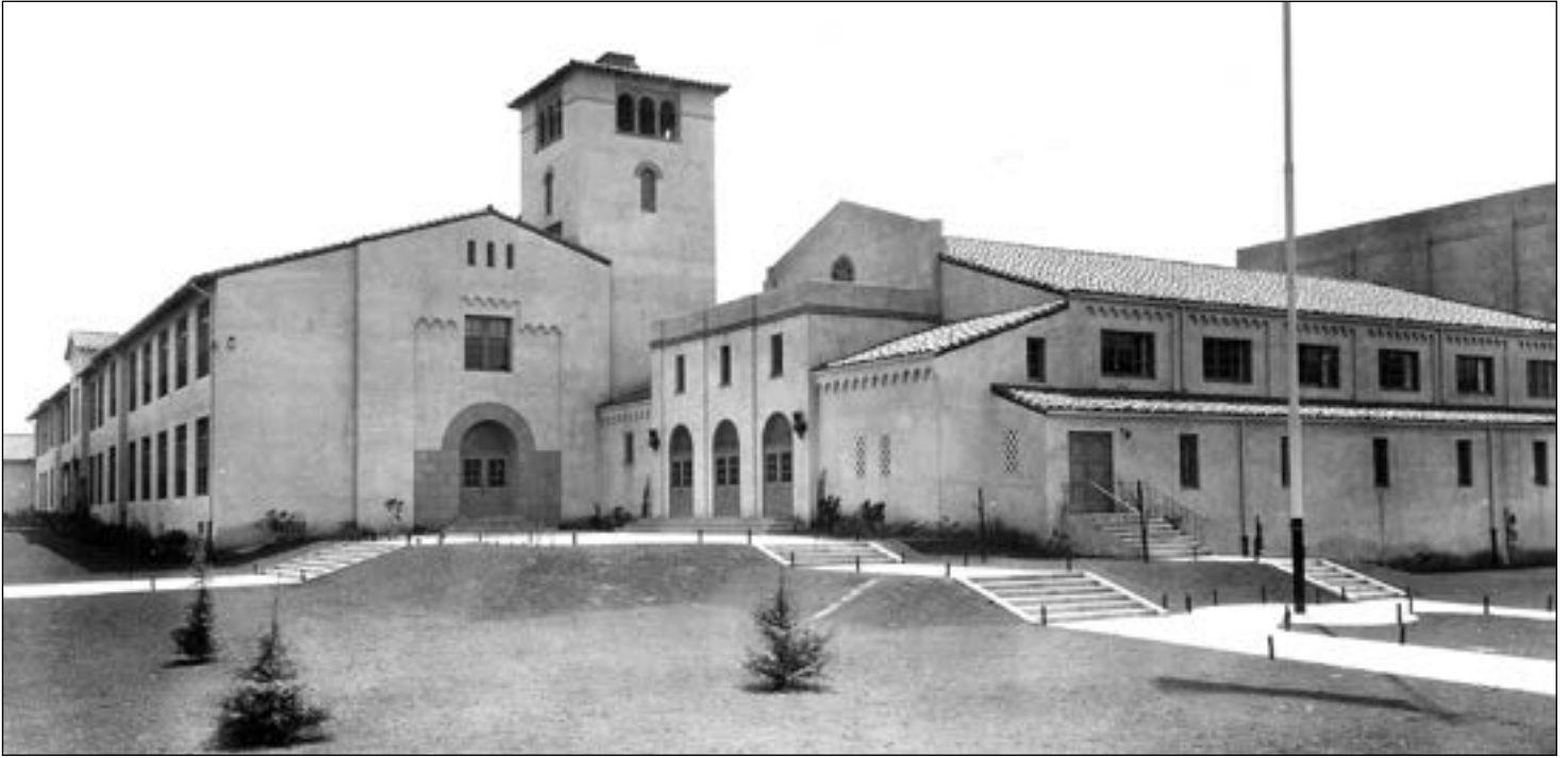
The end of the building, iconic tower and auditorium frame what would come to be known as the senior lawn.