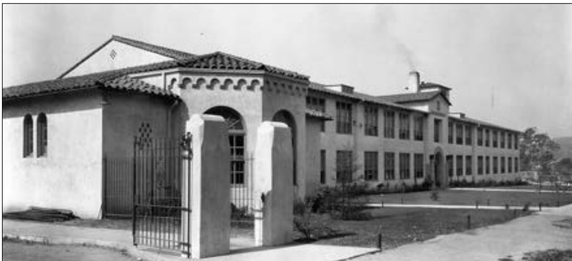
The main building along Yosemite Drive with the library in the foreground.