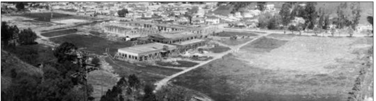
The school under construction in the "Happyland" district in 1927, the football field to the right, Yosemite Park to the left.